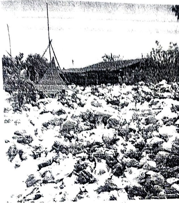
Pic 1: MRF shed/dry waste dumped